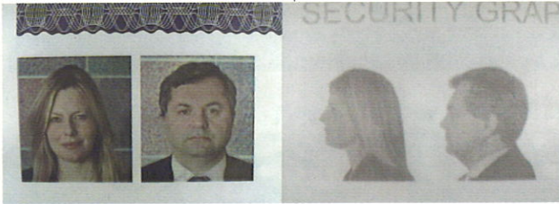
An example of INFRAREDESIGN pictures (RGB and Z)

been proven that there is no correlation between Z, R, G and B values. This means that we can create an infinite number of RGB colors with same Z and same RGB color tones for different Z.